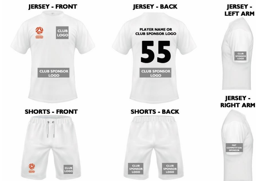
Figure: FNT Senior competitions playing strips style guide