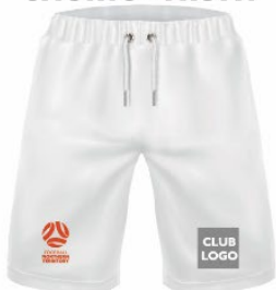
SHORTS - FRONT