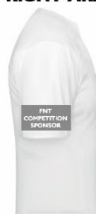
JERSEY - RIGHT ARM