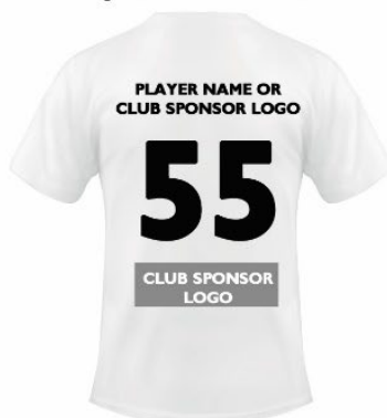
JERSEY - BACK