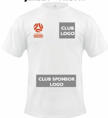
JERSEY - FRONT