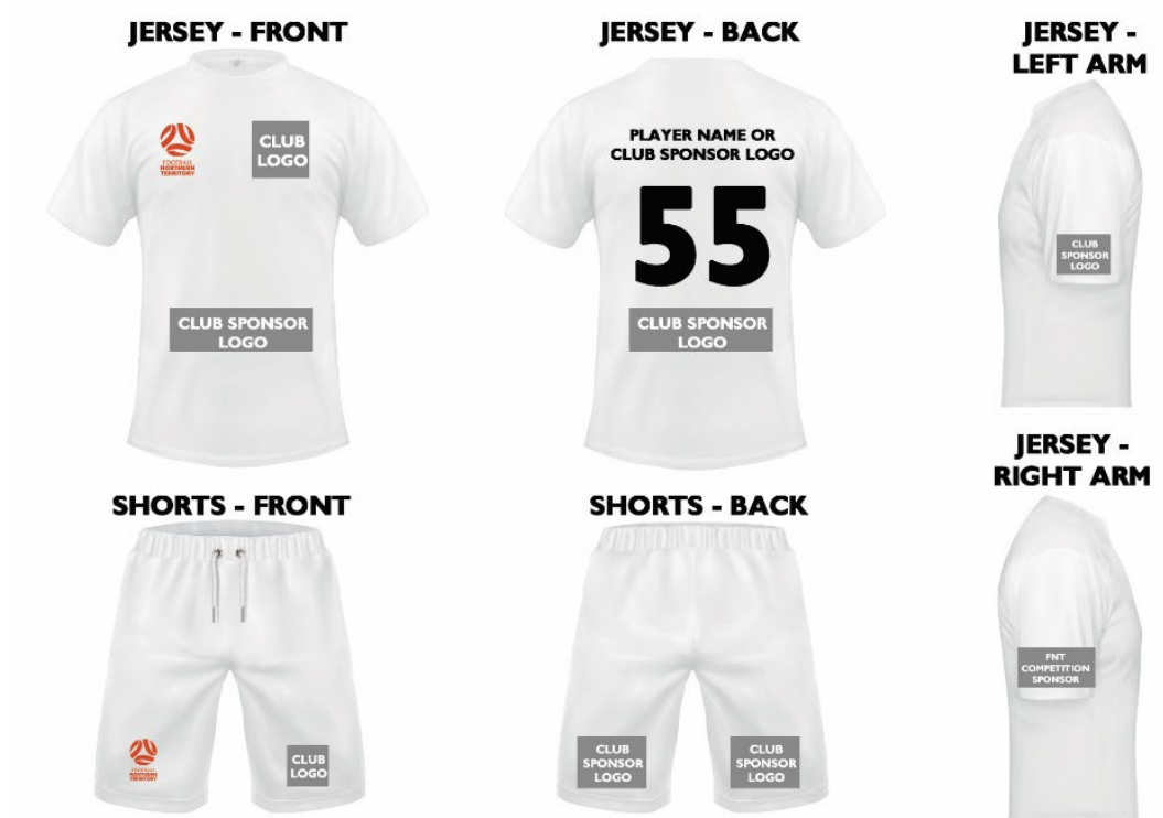
Figure: Football NT Senior competitions playing strips style guide